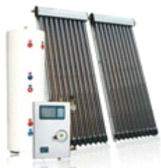
Solar Heating Kits