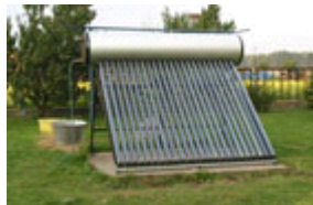
Solar Water Heater